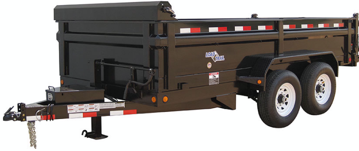
**DT14 stock photo. May be shown with optional equipment.

Ben Hur Trailer Sales 5330 Hamilton Middletown Road Hamilton, OH 45011 - UNITED STATES Phone: 513-896-9940