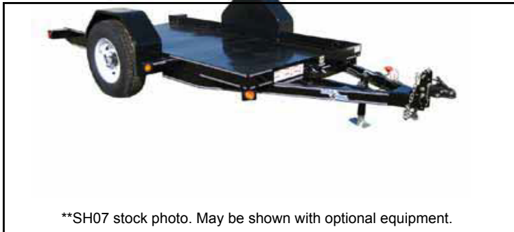
**SH07 stock photo. May be shown with optional equipment.

Ben Hur Trailer Sales 5330 Hamilton Middletown Road Hamilton, OH 45011 - UNITED STATES Phone: 513-896-9940 Web: www.benhurtrailers.com