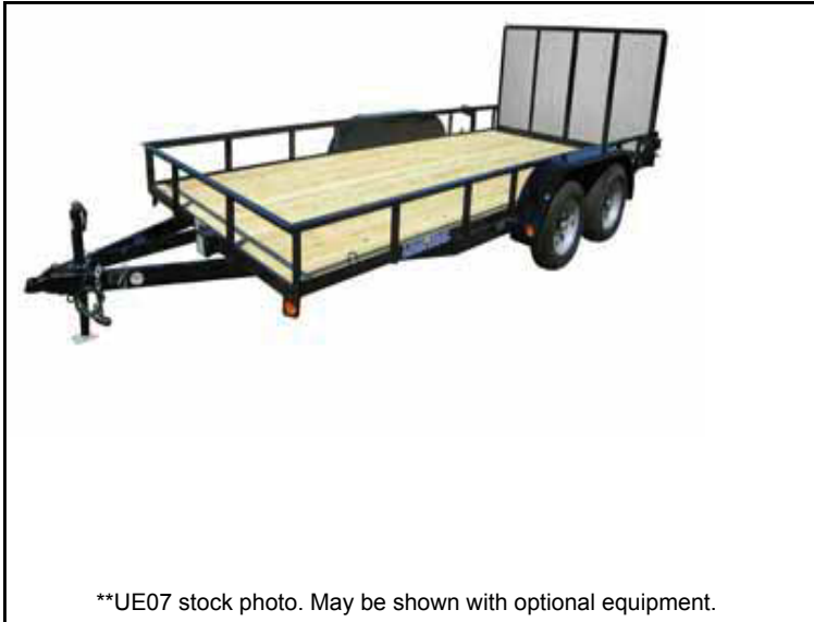
**UE07 stock photo. May be shown with optional equipment.

Ben Hur Trailer Sales 5330 Hamilton Middletown Road Hamilton, OH 45011 - UNITED STATES Phone: 513-896-9940 Web: www.benhurtrailers.com